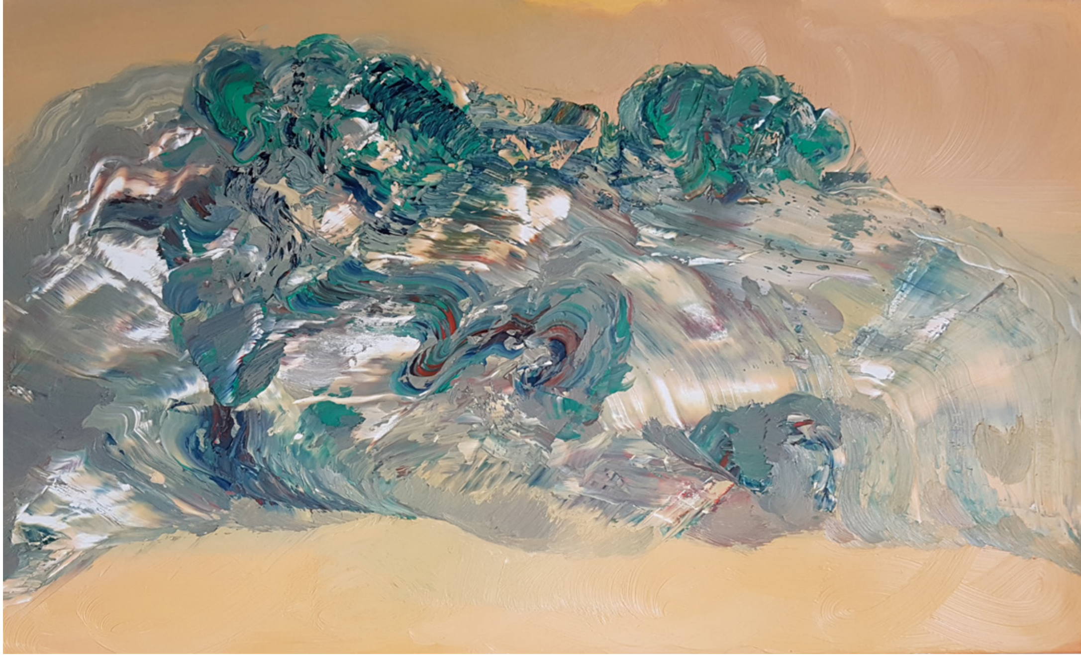
Buesche im Nebel , 2021, 80cm x 120cm, oil on canvas