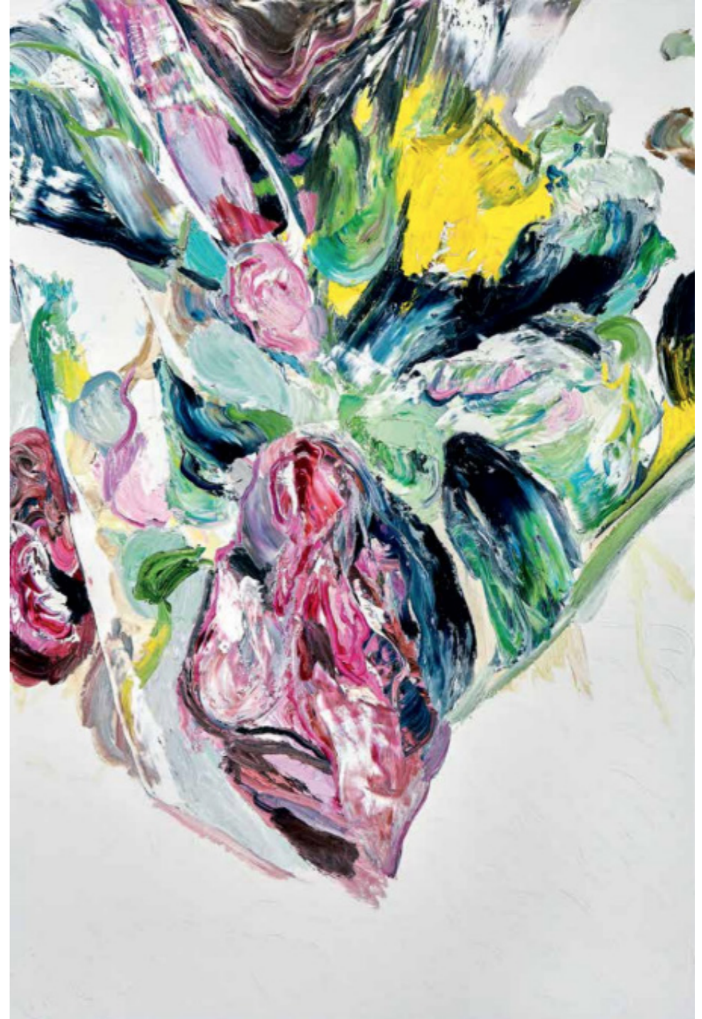
verschiedene Blüten , 2020, 120cm x 80cm, oil on canvas