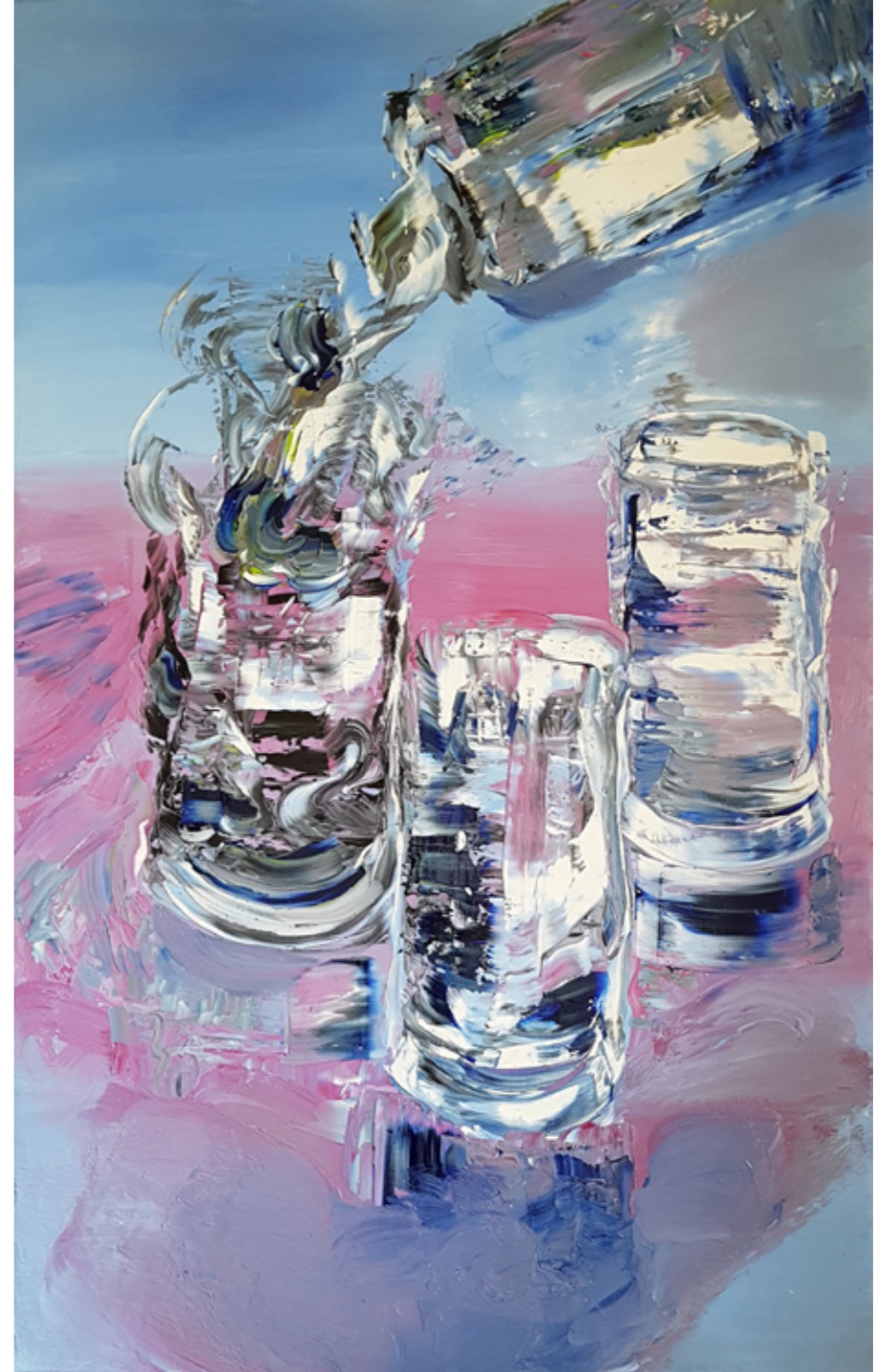
Blue , 2022, 120cm x 80cm, oil on canvas