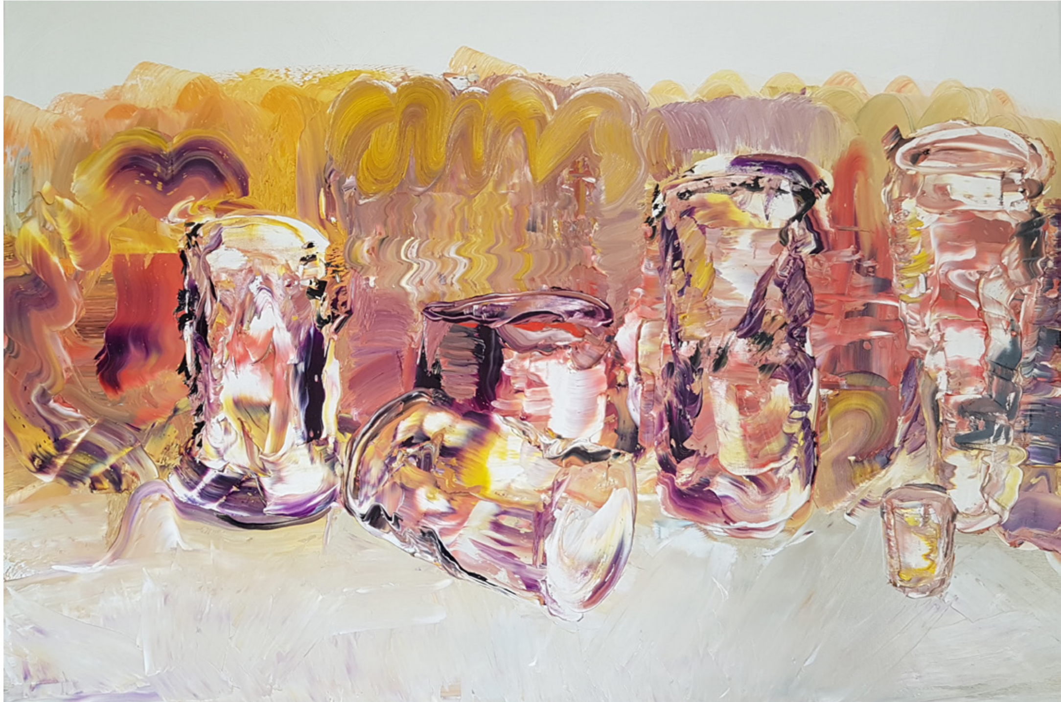
Memorabilia , 2022, 80cm x 120cm, oil on canvas