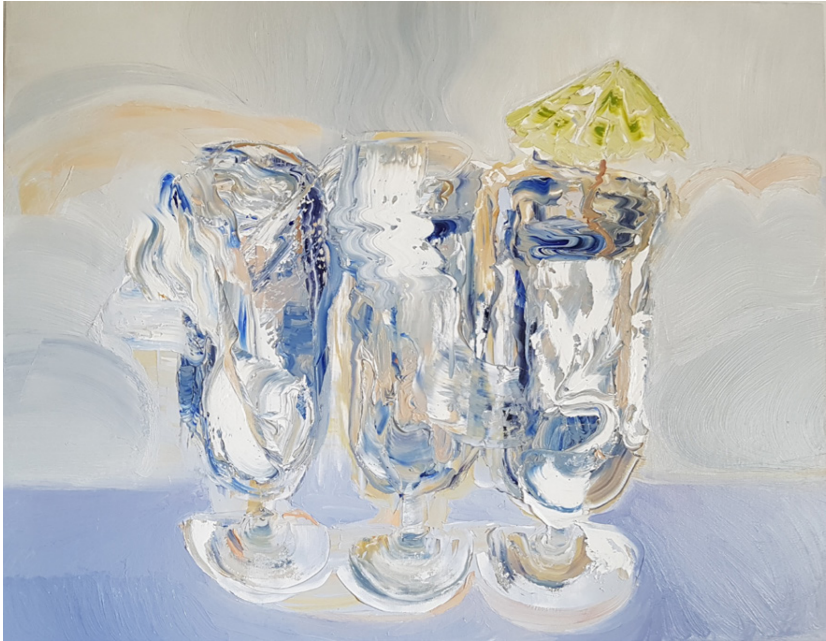
Schierlings Gläser , 2022, 70cm x 90cm, oil on canvas