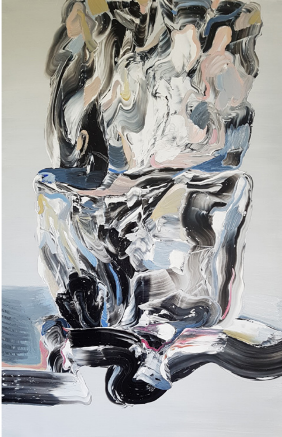
Doppelt cool , 2022, 120cm x 80cm, oil on canvas