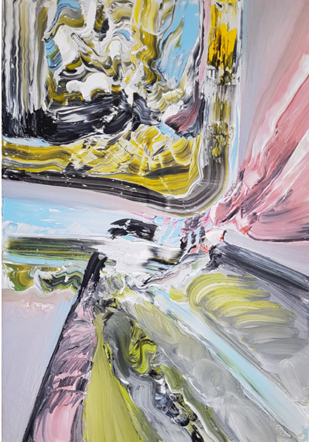
Glassfluss , 2022, 120cm x 80cm, oil on canvas