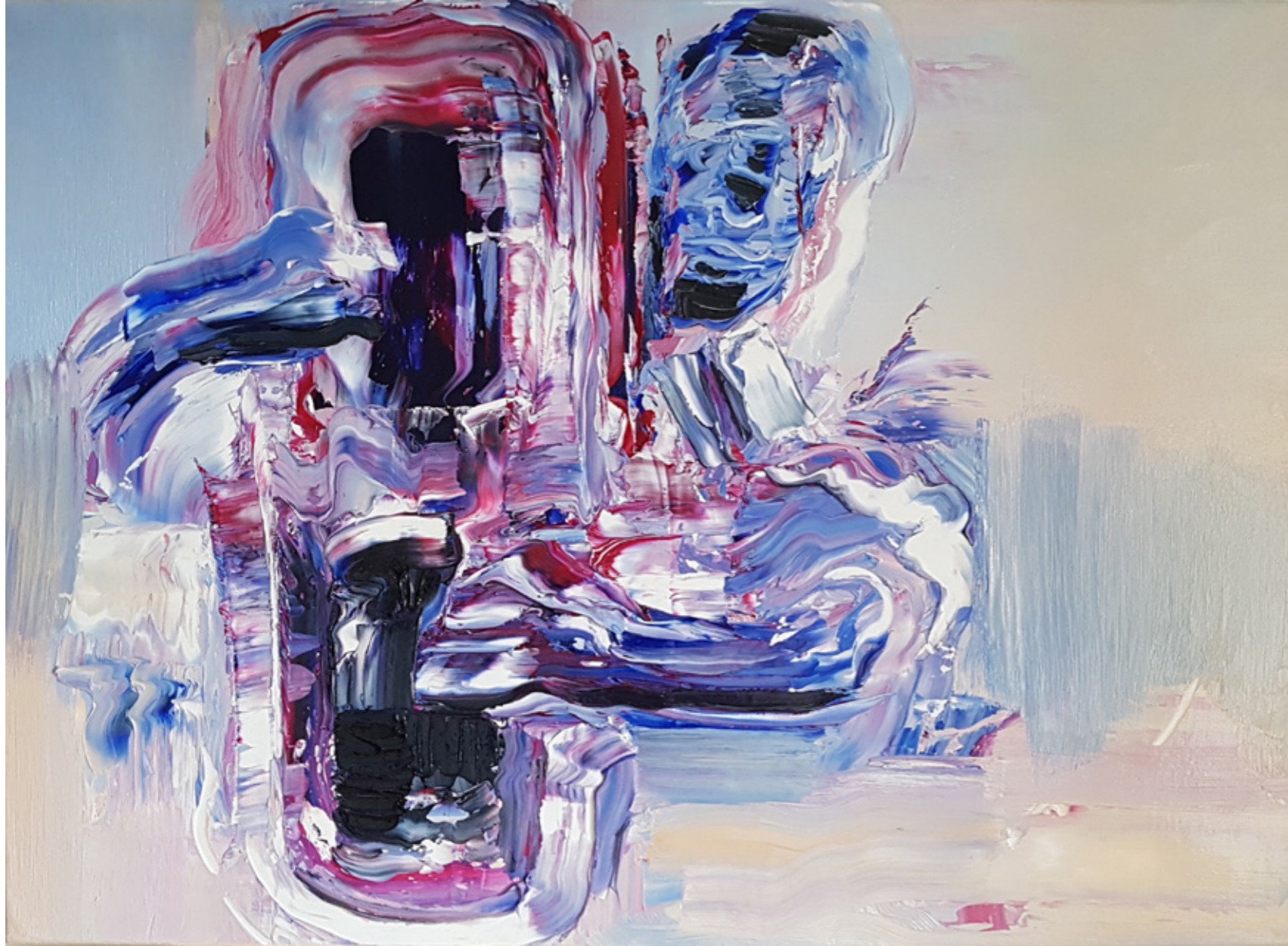
Barcreeper , 2022, 70cm x 90cm, oil on canvas