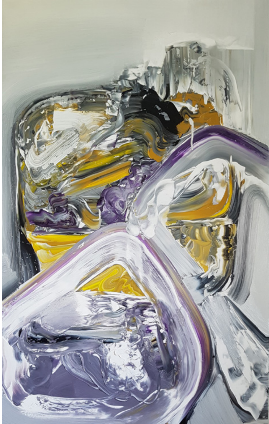
Klunker, 2022, 120cm x 80cm, oil on canvas