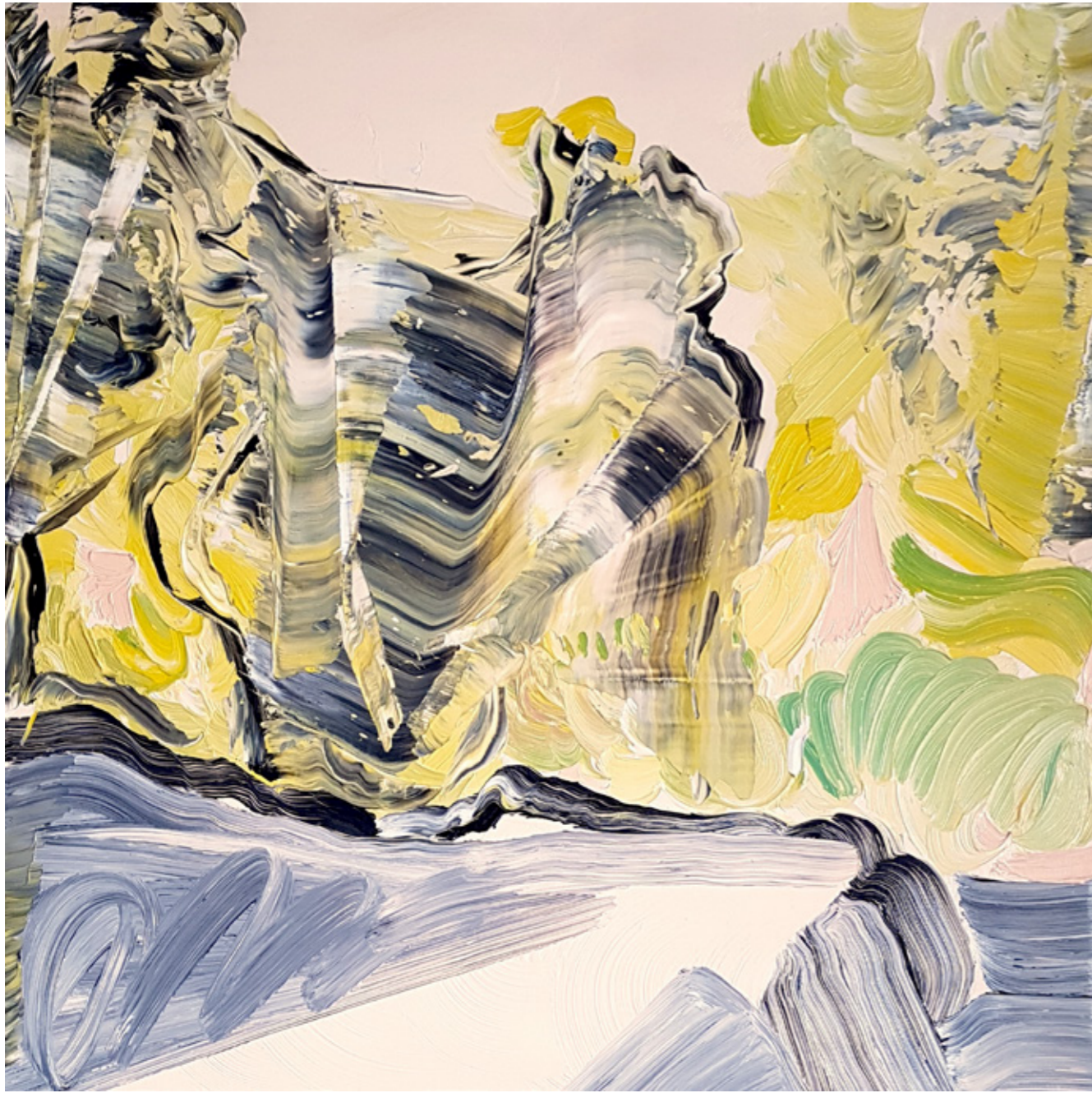
Marmorwald , 2021, 70cm x 70cm, oil on canvas