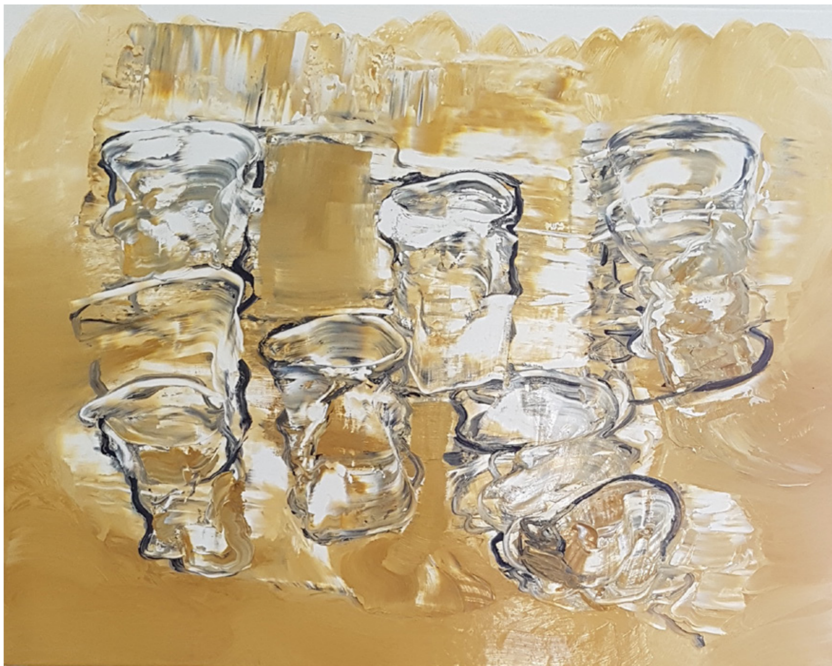
Papercups, 2022, 70cm x 80cm, oil on canvas