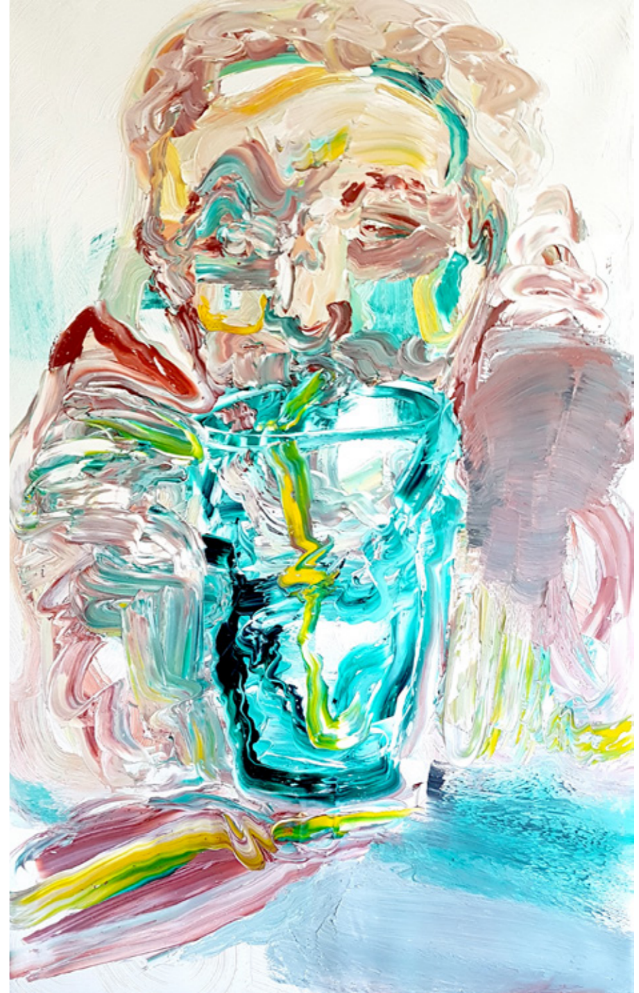
God of Drinks , 2022, 120cm x 80cm, oil on canvas