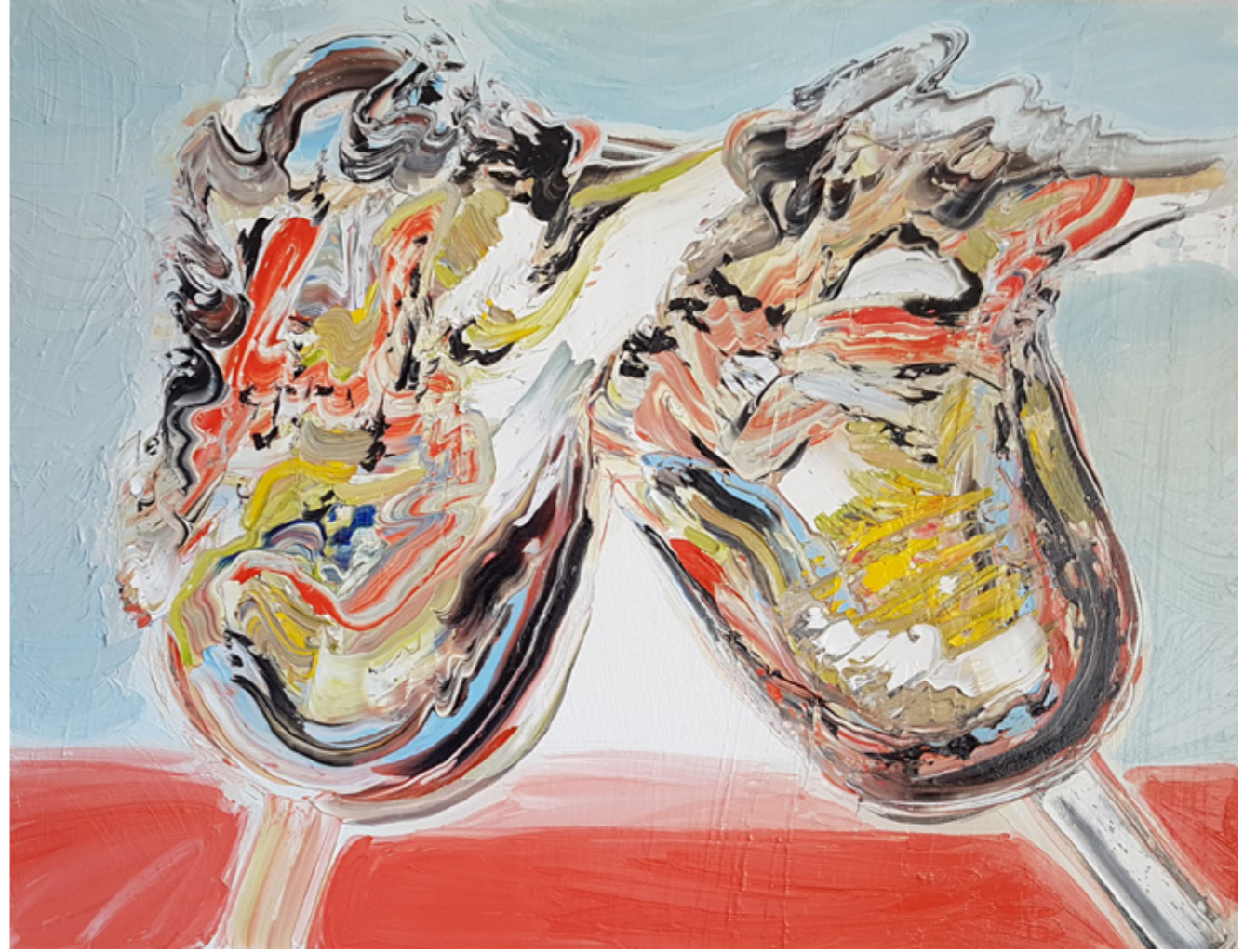
Gin Gin , 2022, 70cm x 90cm, oil on canvas