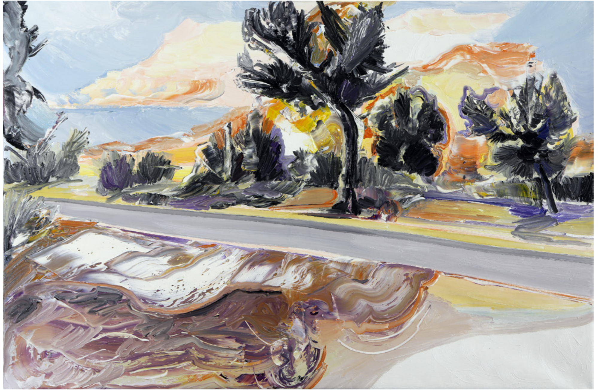
Sonnenuntergang, 2020, 80cm x 120cm, oil on canvas