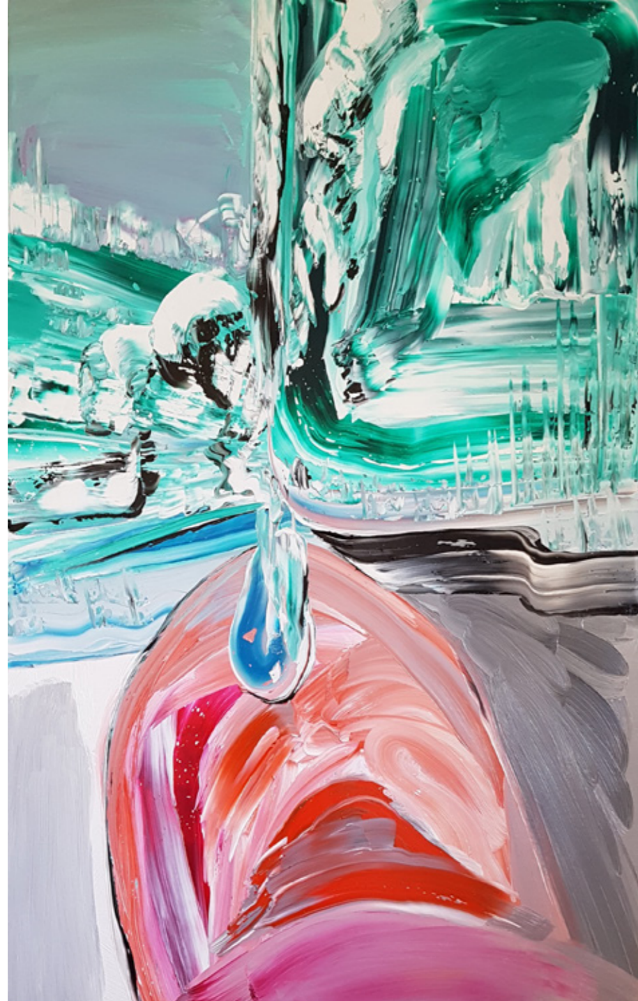
Hangout , 2022, 120cm x 80cm, oil on canvas