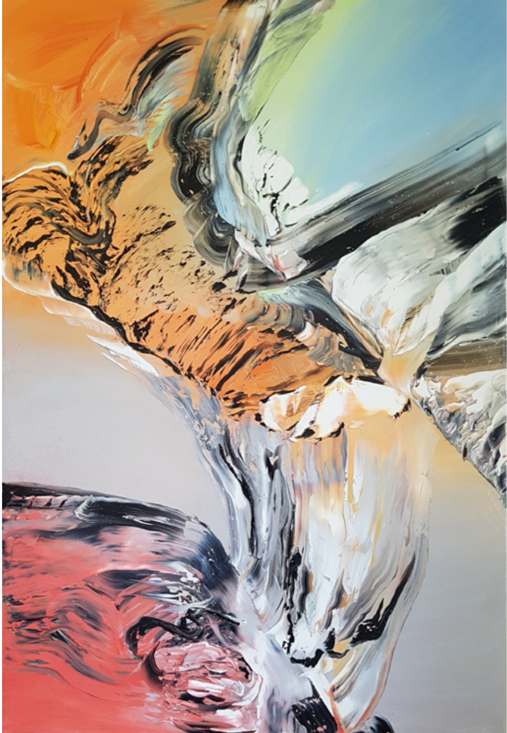
3 Cheers and a Tiger, 2022, 120cm x 80cm, oil on canvas