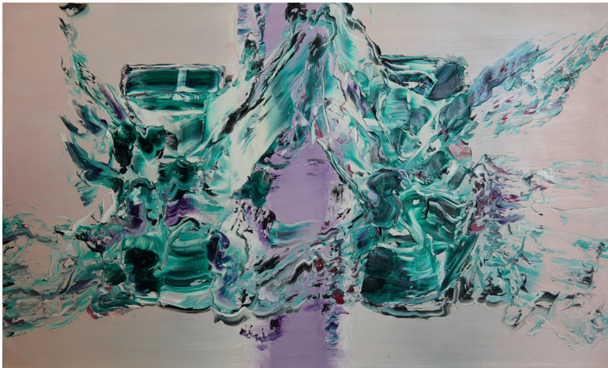
Detox , 2022, 65cm x 105cm, oil on canvas