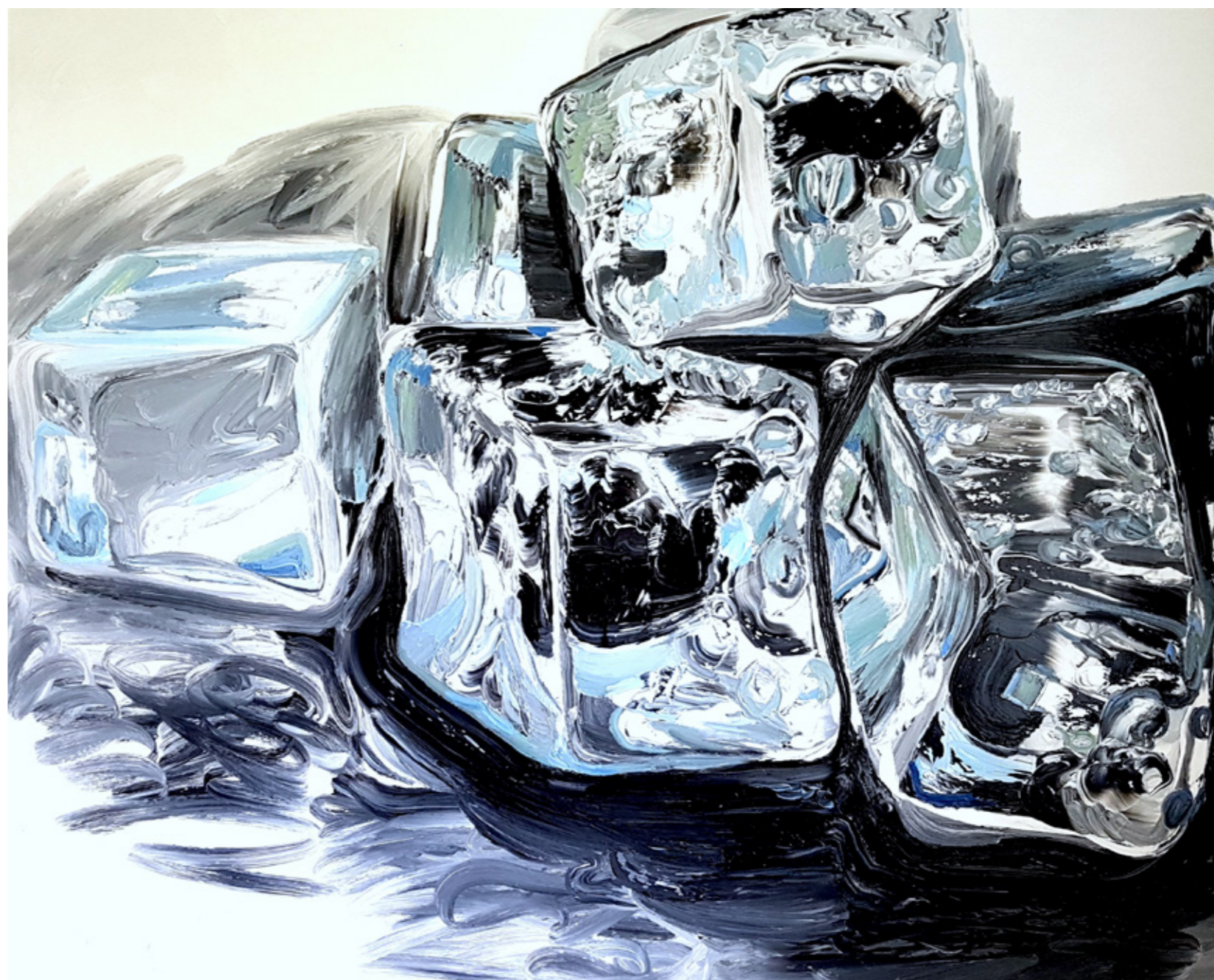
Ice Cubes , 2022, 160cm x 200cm, oil on canvas