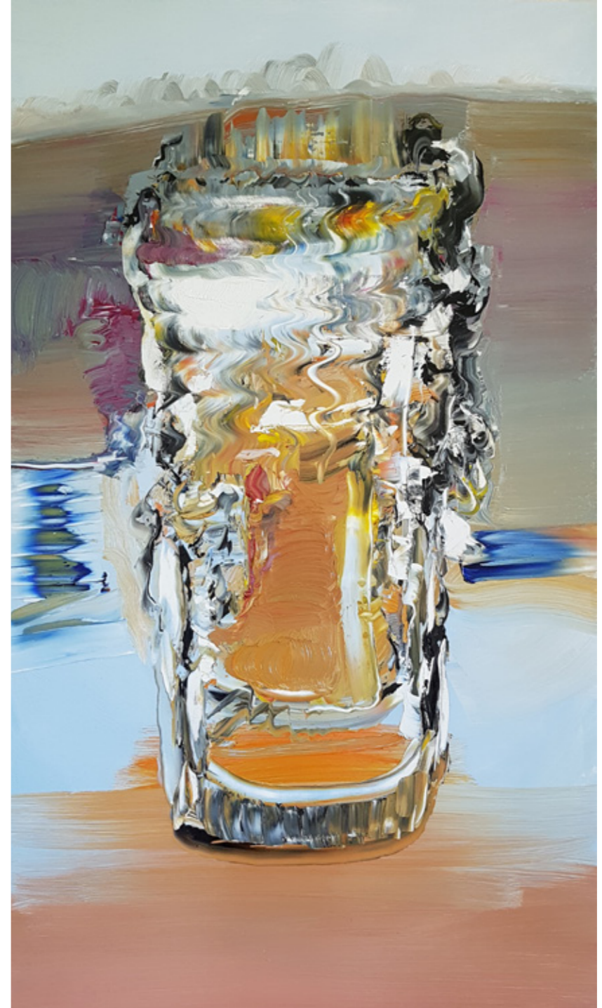
One more , 2021, 120cm x 80cm, oil on canvas