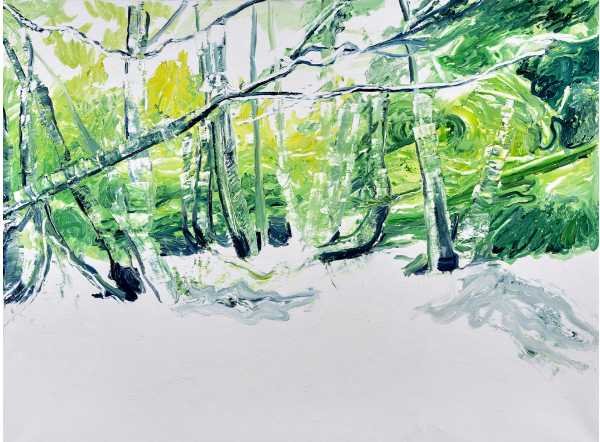
Waldgeister , 90cm x 120cm, oil on canvas