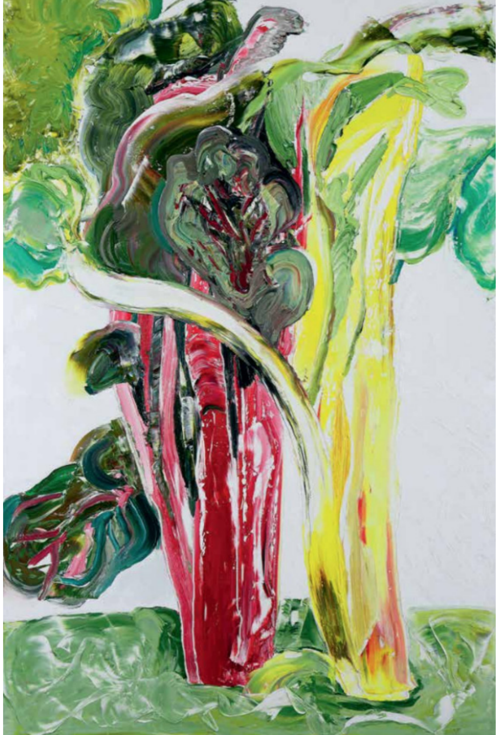
Mangold Zweierlei , 2020, 120cm x 80cm, oil on canvas