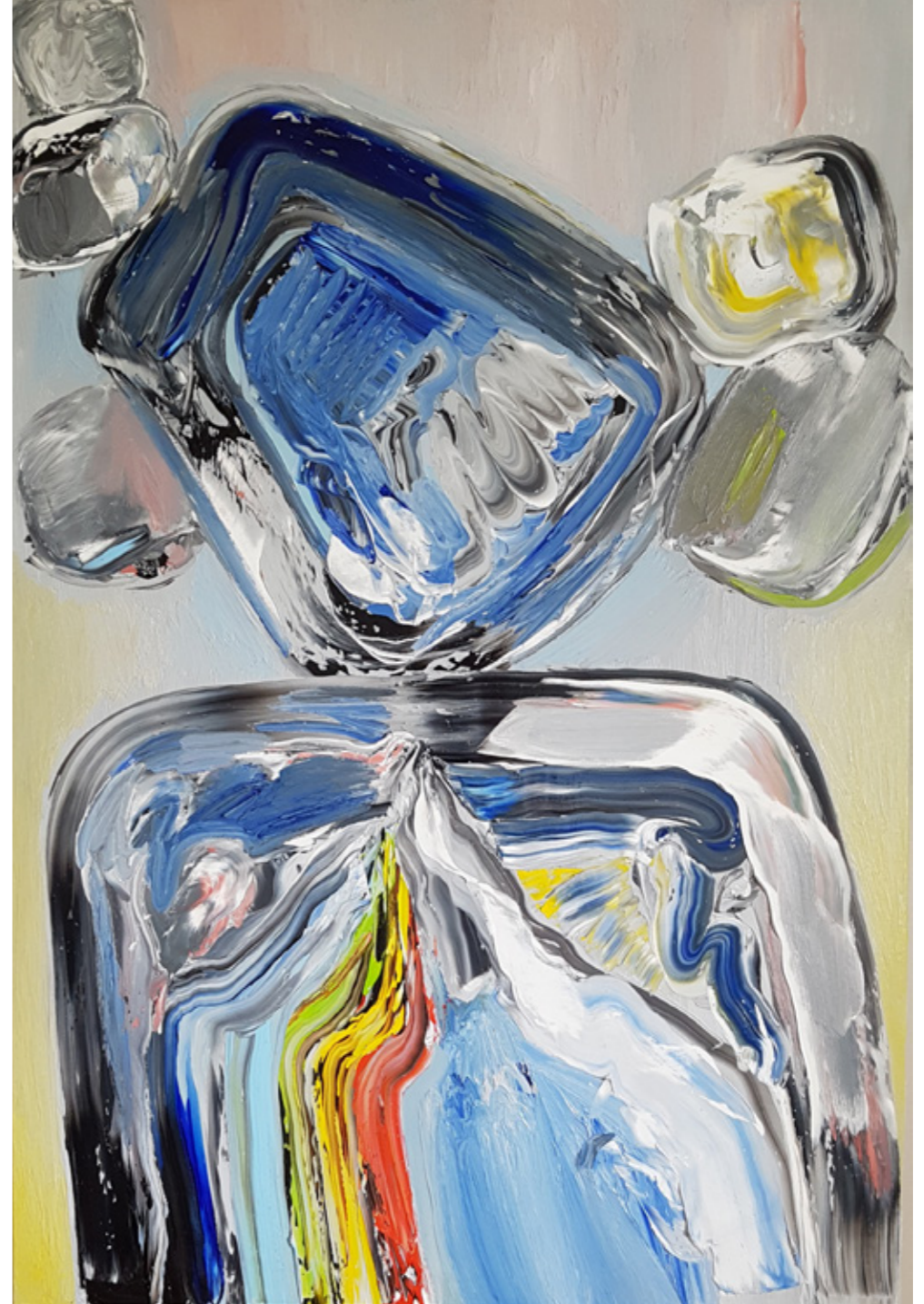
Edle Steine , 2022, 120cm x 80cm, oil on canvas