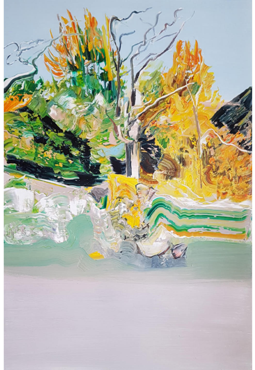
Wilde Landschaft , 2021, 120cm x 80cm, oil on canvas