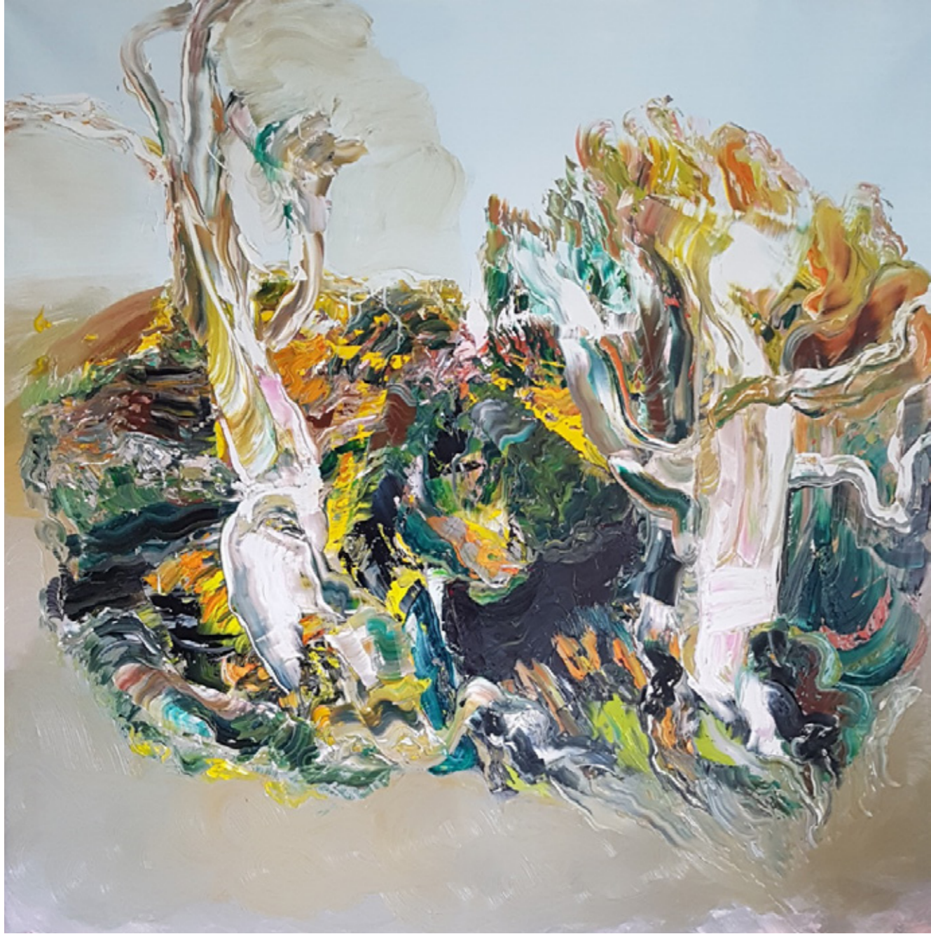
Zwei Riesen , 2012, 160cm x 160cm, oil on canvas