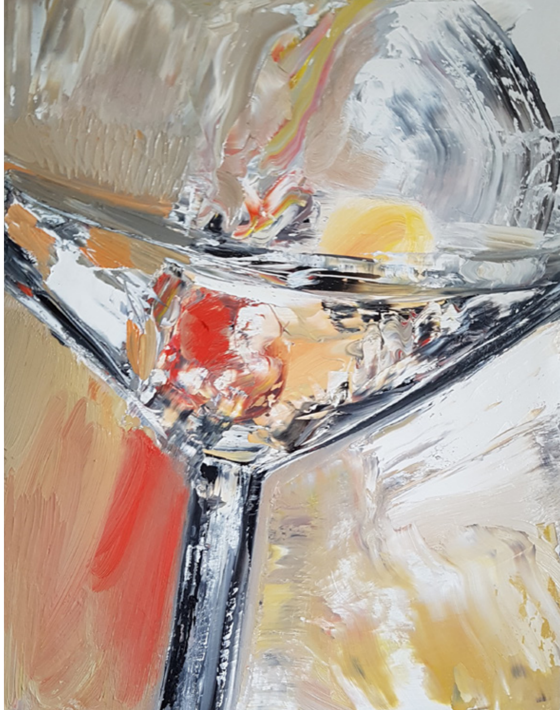
Sunrise , 2022, 70cm x 90cm, oil on canvas