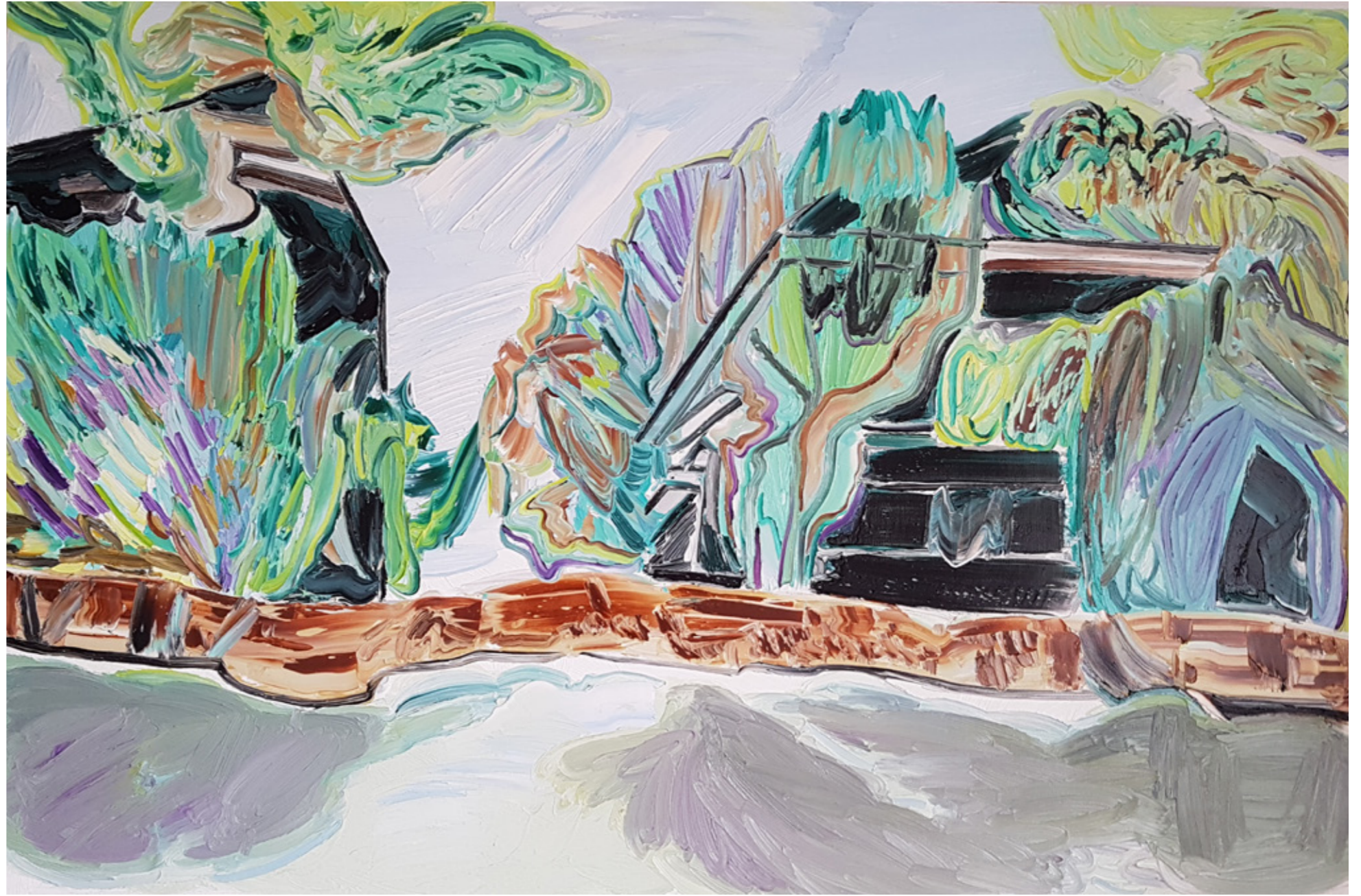
Swallowed Up , 2022, 80cm x 120cm, oil on canvas