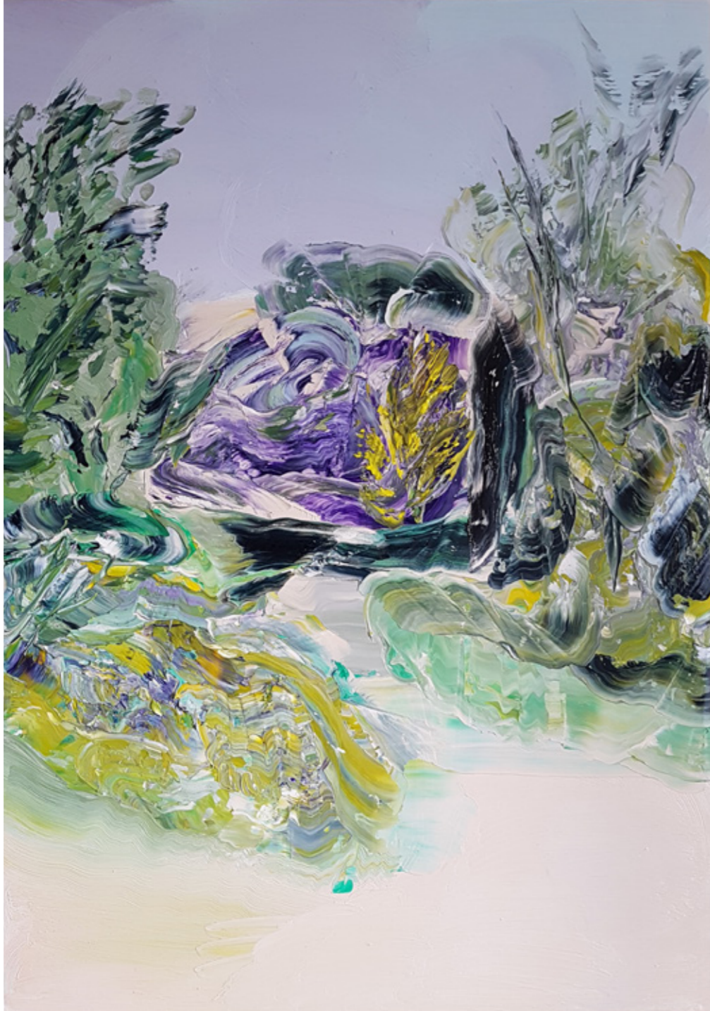
Verschmelzung , 2022, 120cm x 80cm, oil on canvas