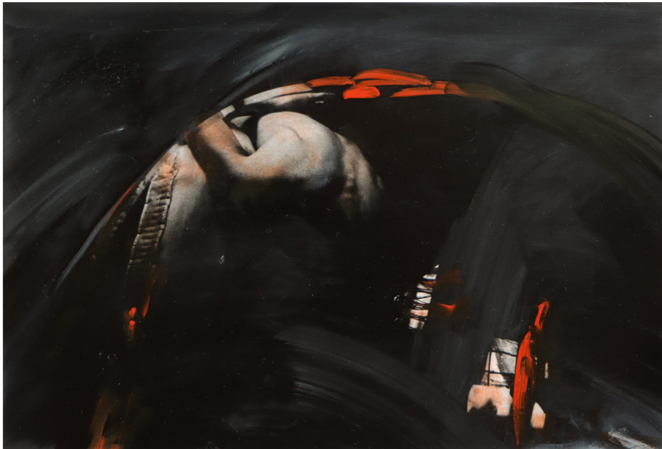
Orbit 2022 Oil on silver gelatin print 20.2 x 25.2 cm 8 x 10 inches £975 framed