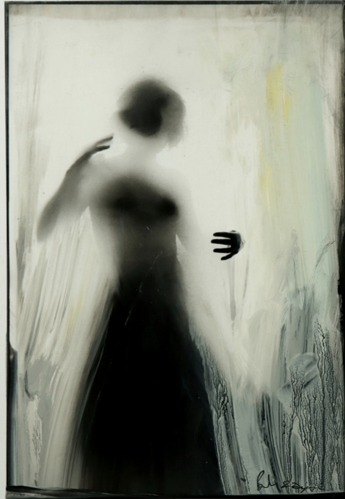
Rayon 2021 Oil on silver gelatin print 30.2 x 24.1 cm 12 x 9.5 inches £1,200 framed